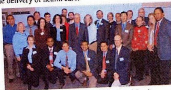
October 2, 2008—EPLP Participants and Faculty with former U.S. Vice President Walter F. Mondale