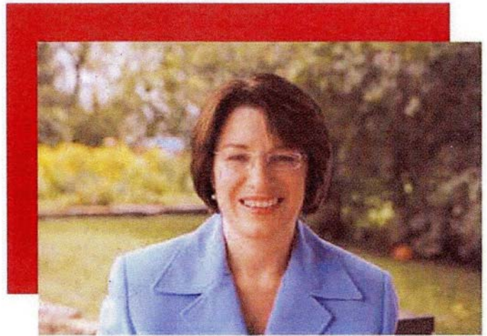
Senator Amy Klobuchar

Amy took the lead to pass significant consumer product safety legislation. She acted quickly to obtain full funding for the I-35W bridge. She introduced legislation to secure health and education benefits for our nation's veterans. And she helped pass the most sweeping ethics reform since Watergate.